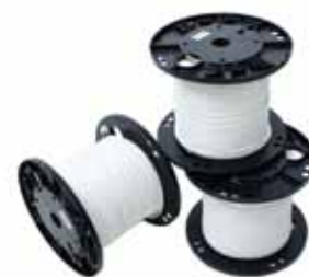
NYCE POF Plenum Rated High Quality 2.2mm Plastic Optical Fiber